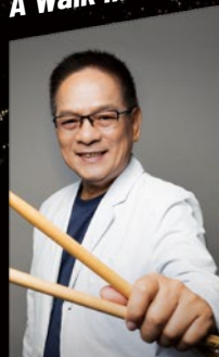
Taiwan Drum King Huang Rui-feng