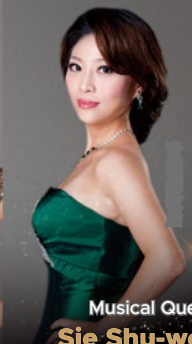
Musical Queen Sie Shu-wen