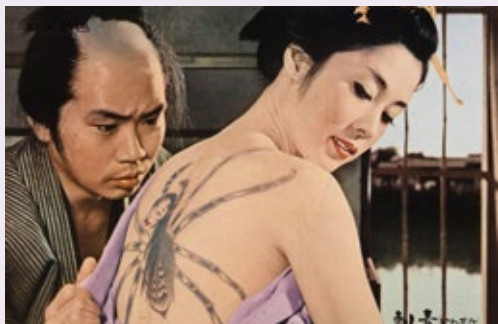
The Spider Tattoo 2.19 Sun. 16:00 Reel ONE • 2.24 Fri. 20:30 Reel ONE