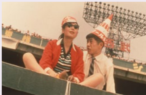
Giants and Toys 2.22 Wed. 20:30 Reel ONE • 2.25 Sat. 11:30 Reel TWO