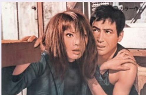
The Blind Beast 2.19 Sun. 18:00 Reel ONE • 2.25 Sat. 20:30 Reel ONE