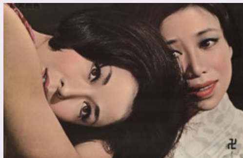
All Mixed Up 2.19 Sun. 20:00 Reel ONE • 2.23 Thu. 18:30 Reel ONE