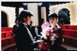
Dances with Dragon

1.24 Tue. 18:30 • 1.25 Wed. 18:30 1.29 Sun. 17:00