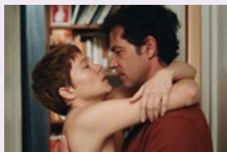
One Fine Morning

1.3 Tue. 13:00 • 1.4 Wed. 14:00 1.5 Thu. 13:00 • 1.7 Sat. 14:00 1.11 Wed. 14:00 • 1.18 Wed. 15:00