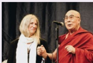
Never Forget Tibet

1.3 Tue. 20:00 • 1.4 Wed. 17:00 1.4 Wed. 19:30 • 1.5 Thu. 20:00