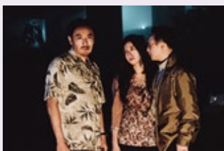
The Shadow Play