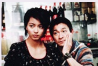
Fat Choi Spirit

1.24 Tue. 18:30 • 1.25 Wed. 18:30 1.29 Sun. 17:00