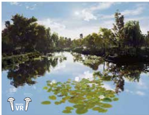
Claude Monet -The Water Lily Obsession