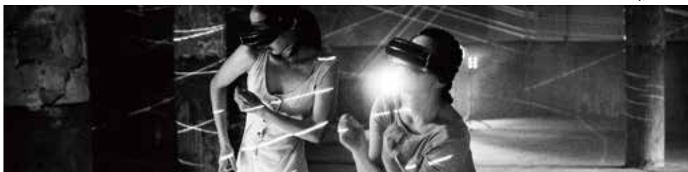
Afterimage for Tomorrow