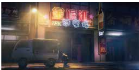
The Abandoned Deity