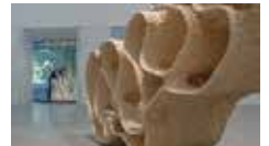
▲ A view of the exhibition

An internationally recognized Taiwanese artist, Yunghsu Hsu is distinguished by his broad artistic vision and drive towards creative expression. He has long focused on formal experimentations with the texture of ceramic materials, enlarging the space of his kilns to accommodate an aspiration to extend the limits of ceramics to unprecedented levels of thinness, clarity and solidity. Hsu makes numerous openings and gaps in layers of hand-kneaded ceramic, allowing warm light to flow through the pieces, forming organic 'crystals' on the surface of the work. In this exhibition, KMFA presents twenty-one of the artists' representative works from 2011 to the present, including 2019-1, a large-scale, singularly-fired sculpture nearly two stories high with a production process that thoroughly challenged Hsu's physical stamina, technical finesse and firing knowledge. With his breathtaking pieces, constantly evolving practice and humour, Hsu leads the viewer into 'a world made light'.